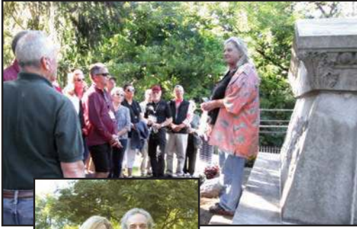
Left: Hartsdale plays host to 100 members of the International Association of Pet Cemeteries and Crematories.