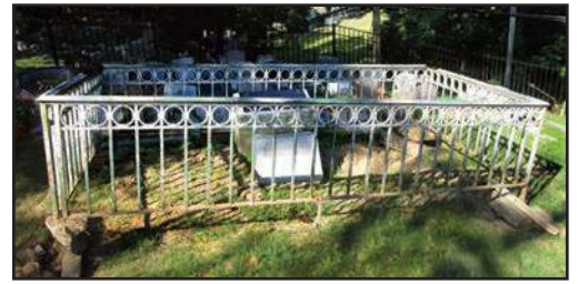
Right: A unique hand-forged Edwardian lot fence is restored to pristine condition.