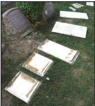
Below: A fine but fragile box crypt is reassembled and restored.