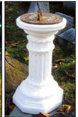
Vintage garden statuary throughout the cemetery restored to their former glory.