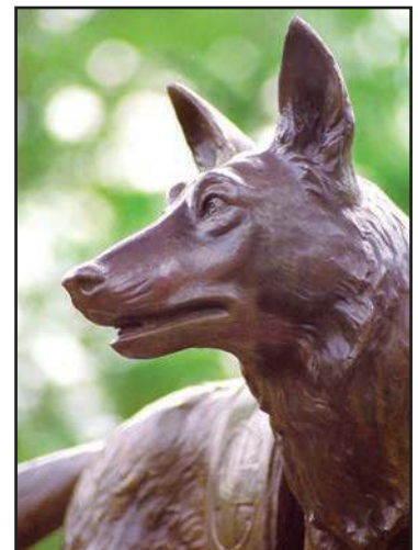
The War Dog is revitalized.